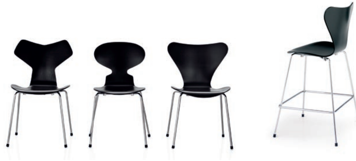
3130, 3101, 3107 and 3197. Design by Arne Jacobsen. Chairs for canteens, cafés and lounge areas. Design classics which come in many different colours, leather and textiles.