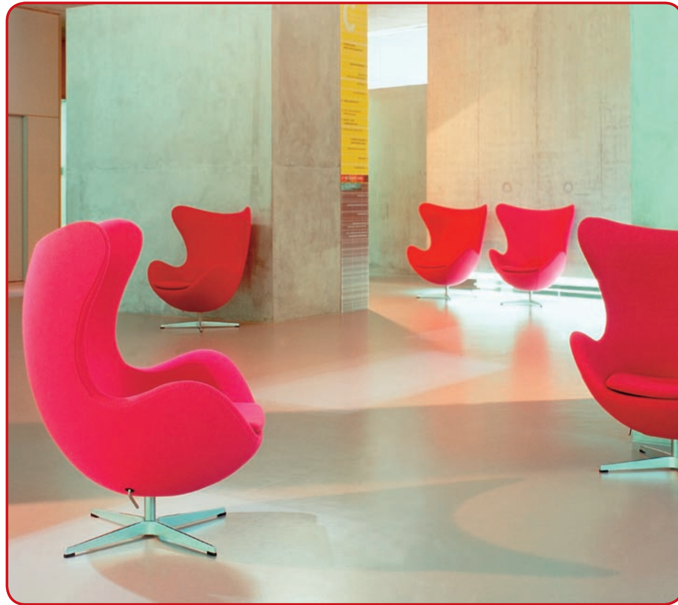
The Egg. Design by Arne Jacobsen. The design classic was developed in 1958 for the Royal Hotel in Copenhagen. The clever shape of this multiple award-winning chair affords privacy in the otherwise public space. With its aesthetic impact, the Egg perks up any lounge or recreational area.