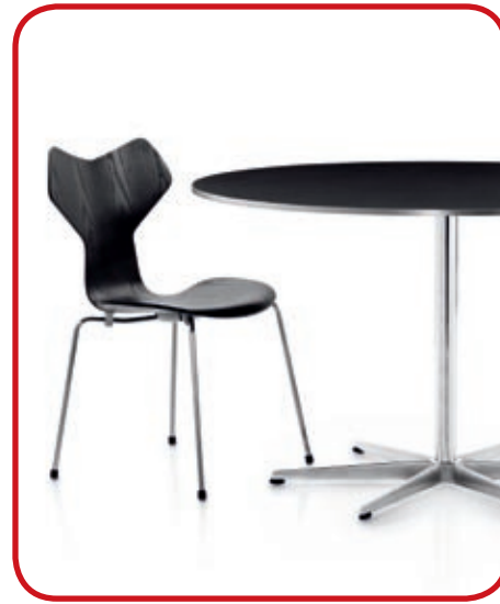
Grand Prix, 3130. Design by Arne Jacobsen in 1970. Reintroduced in 2009.