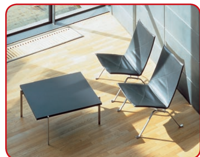
PK22 chairs, PK61 table. Design by Poul Kjærholm. Chairs and coffee table in an exclusive and minimalist design, ideal for lounge and waiting areas.