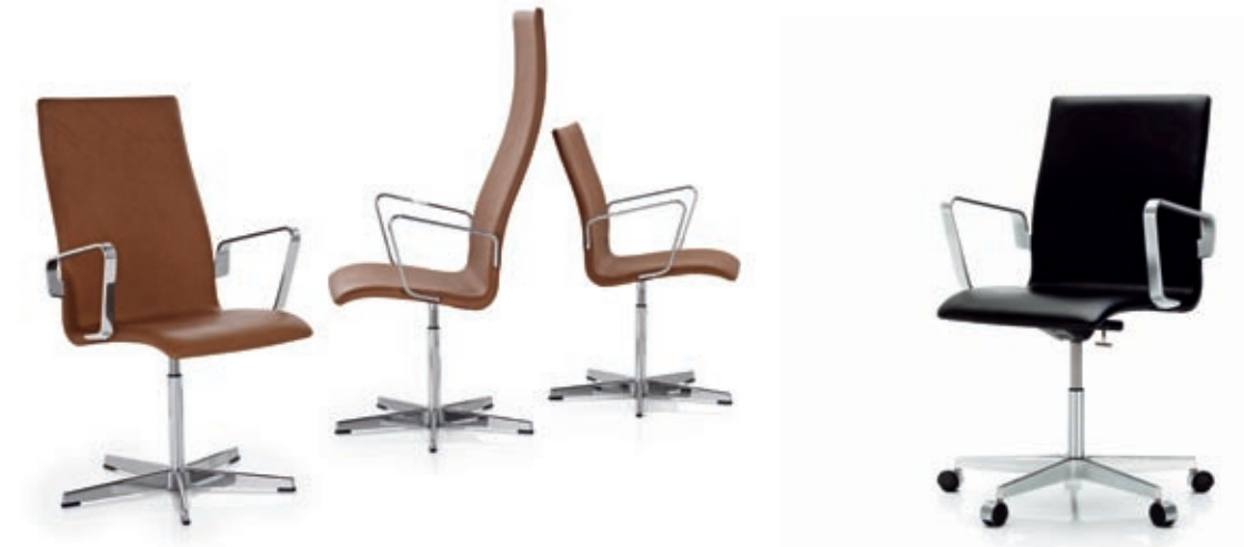
Oxford. Design by Arne Jacobsen. Series of chairs for the office or the conference room, designed to suit natural body shapes. Seat height adjustment and tilt mechanism. Ergonomics and comfort combined to form a functional and aesthetically pleasing design.