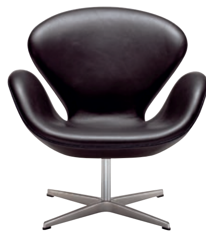
The Swan. Design by Arne Jacobsen. Today, this chair is a classic in its original shape, for lounge and waiting areas.