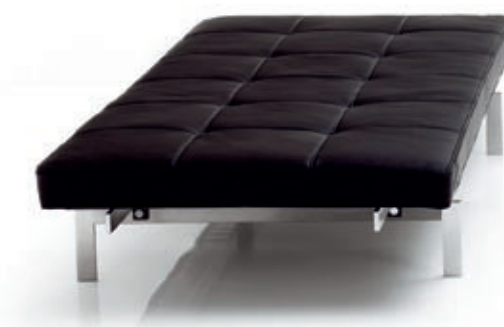
PK80. Design by Poul Kjærholm. The bench is designed with the aim to unite the sublime with the absolutely necessary. For lounges and waiting areas.