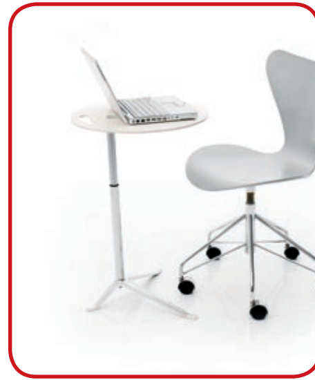
Little Friend. Design by Kasper Salto. Versatile and height adjustable side table.