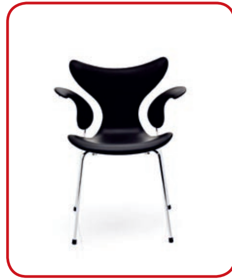
Lily, 3208. Design by Arne Jacobsen. Its perfect curves ensure best comfort.