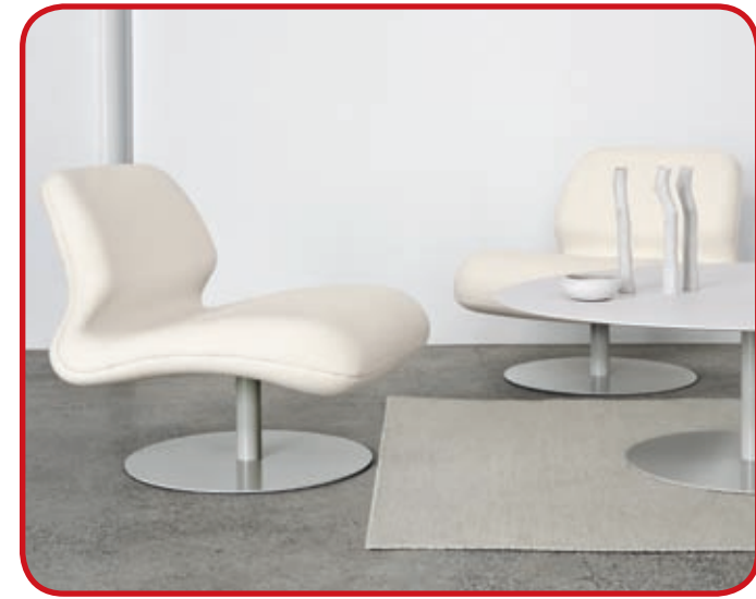
Attitude. Design by Morten Voss. The lounge series of the Danish designer signals courage, character, attitude and individuality.