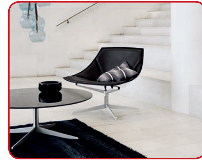
Space lounge collection. Design by Jehs Laub. Lounge chairs and tables in a dynamic design and new materials. Suitable for commercial as well as domestic interiors.