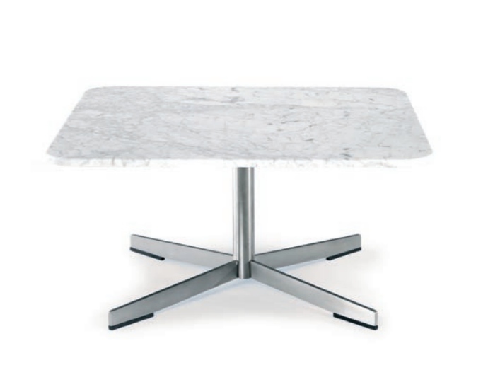
2Leather. Design by Rodolfo Dordoni. Bistro and lounge tables complete the series. Steel column leg with white marble “bianco carrara” top.