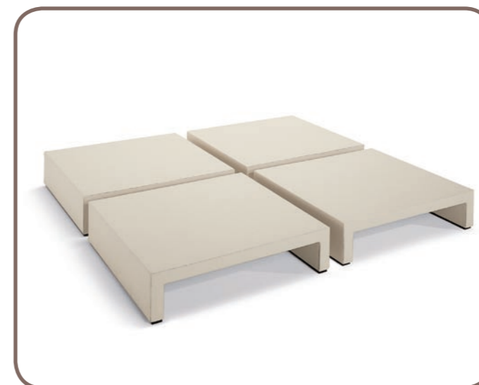
Openside. Design by Franco Poli. Coffee tables covered in coach hide and soft leather seating that go perfectly with Openside sofas. Three sizes.