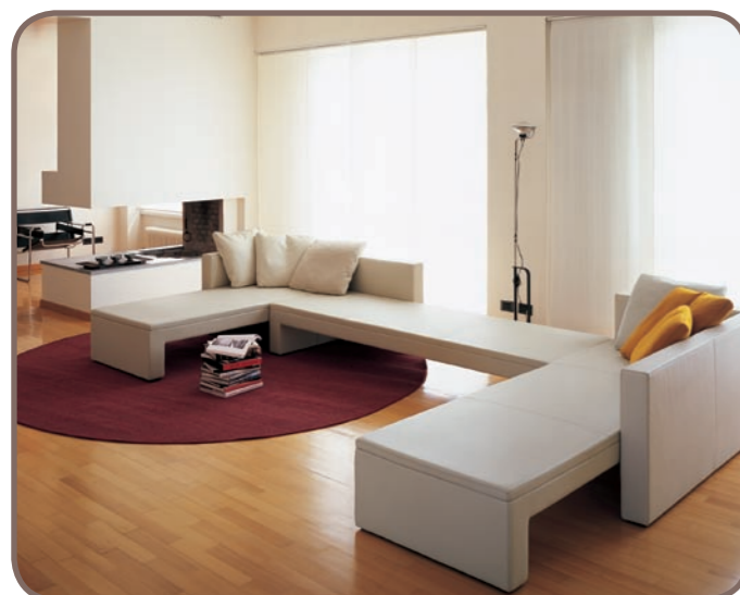
Openside. Design by Franco Poli. A series for many optional combinations and configurations. Leather-upholstered.