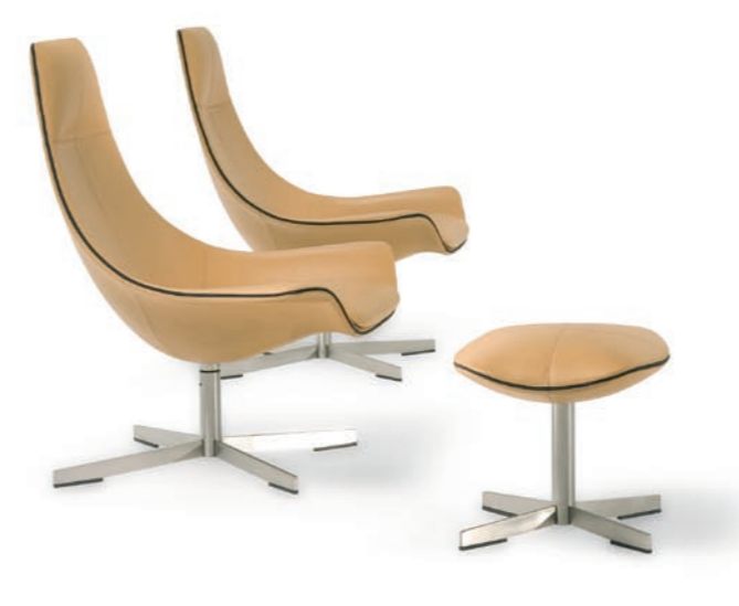
2Leather. Design by Rodolfo Dordoni. The 2Leather series comprises swivel leather armchairs with two different heights of back rest. Chrome-plated column leg, star-shaped base. Stool. A programme that invites to relax.