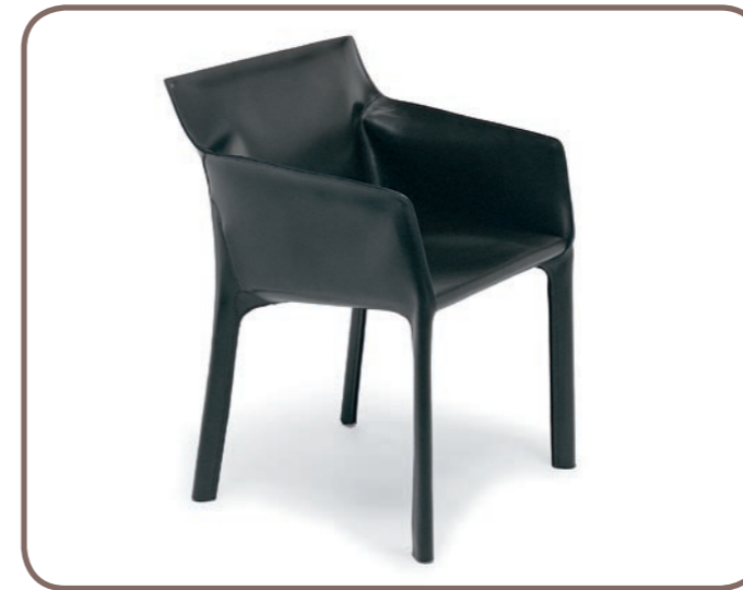
Coco Chair. Design by E00S. A chair that impresses with its strong design. Shell and frame are coach hide covered.

These excellent designers are the “genetic make-up” of the company Matteograssi. The quality of the craftsmanship and the experimental approach to leather bring forth products that had not been made of leather before. As a result of their specialization Matteograssi was able to establish itself in furnishing offices, public areas and airports. Matteograssi has received numerous design awards. In 2004, the firm was awarded the “Compasso D’oro Award” for its seating system Kube.