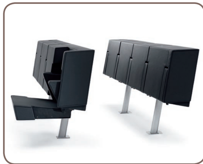
Kube. Design E00S. Seating system for conference centres, auditoriums, theatres and cinemas. Meets exacting technical demands.