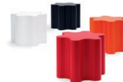
FLOWER. Design by Eero Koivisto. Versatile pieces made out of cold foam. To be used as either a side table or chair and easy to place.