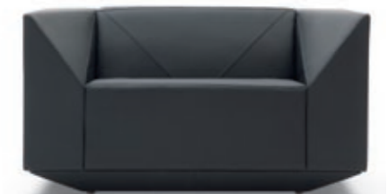
GHOST. Design by Eero Koivisto. Ghost combines a modern interior shape with a classic cubic exterior. Available as a sofa and easy chair.