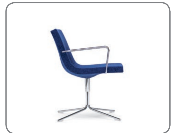
BOND CHAIR. Design by Jean-Marie Massaud. Available as a lounge or meeting chair, Bond can be used in any application.