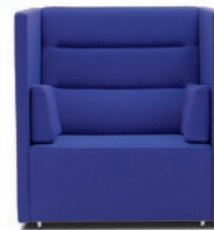
FLOAT HIGH. Design by Eero Koivisto. Like a small separate room, that provides privacy in open spaces. Available in 95 cm or 130 cm height.