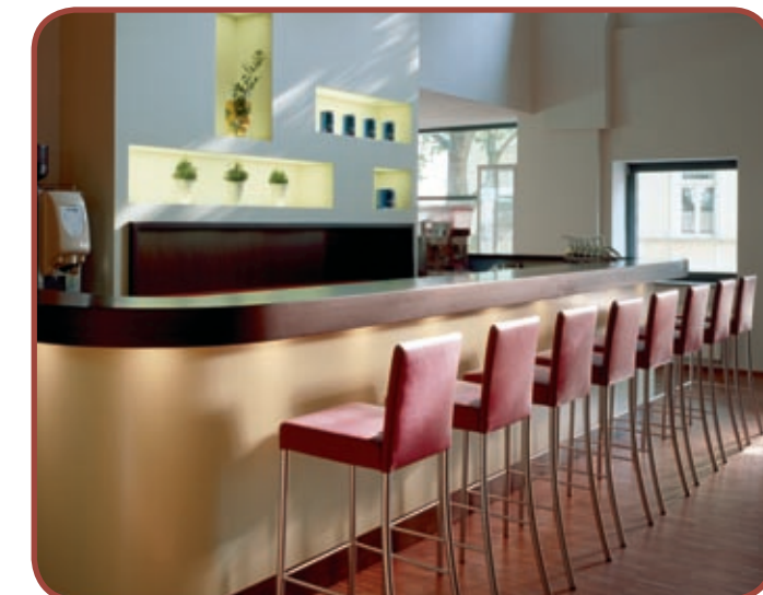
Jason. Design by EOO. Jason revisited. High chair with short back rest and the familiar seating comfort of the range. For interaction in the office or at the bar.