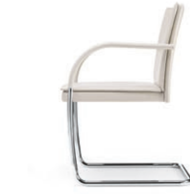
George. Design by EOO. Quiet elegance and understatement. Particular attention was paid to the leather-covered and hand stitched arm pads.