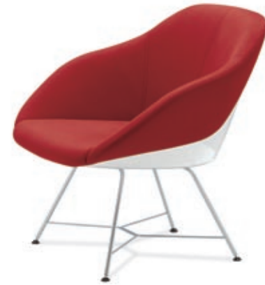
Turtle. Design by Pearson Lloyd. Bold interpretation of natural, organic shapes. The dynamic, upholstered shell ensures maximum comfort. Turtle swivels easily on a plate or star-shaped swivel base. Also available as a four-legged chair. The bar stool complements the overall Turtle series.