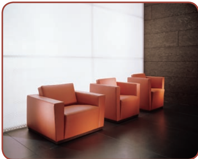
Elton. Design by Jan Kleihues. An easy chair with clean lines that comes in three sizes. The small and medium-sized chairs are available with concealed castors as an option.