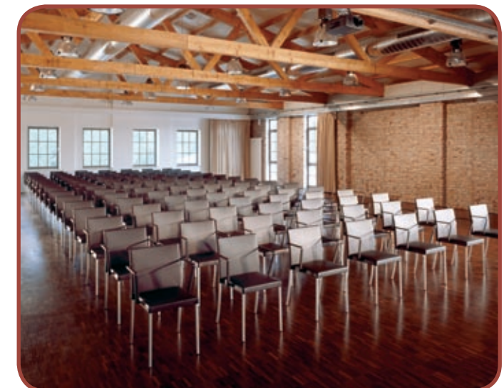
Jason Lite. Appeals through maximum comfort thanks to a pocket sprung core and torsion springs whilst being functional and stackable at the same time.