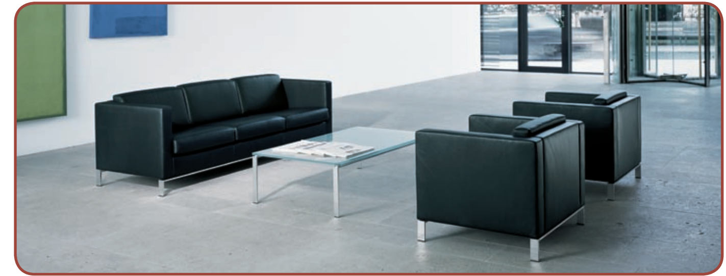
Foster 500. Design by Norman Foster. Contemporary and timeless. Consistent down to the smallest detail. Authentic, ergonomic and comfortable. Available in multiple combinations with cushioned seats and glass tables.