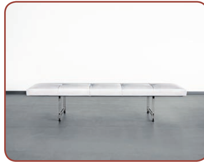
Foster 510. Design by Foster + Partners. Minimalist design, maximum comfort. With special attention to detail: fine stitched piping and drawn-in leather divide the comfort zones. With or without a backrest. Discreet stability is provided by the minimalist legs.