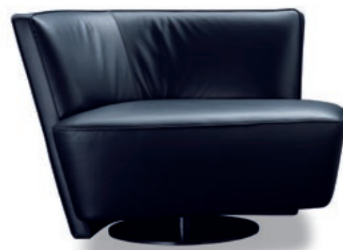
Drift 201. Design by EOO. The Drift chair follows the sofa design and stands out as a distinctive single iconic furniture piece.