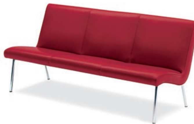
Vostra. Design by Walter Knoll Team. The timeless re-edition of the reduced, fifties design is traditionally made with a solid beech wood frame.