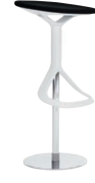
Lox. Design by PearsonLloyd. The stylish swivelling barstool is comfortable and can be adjusted to the height required.