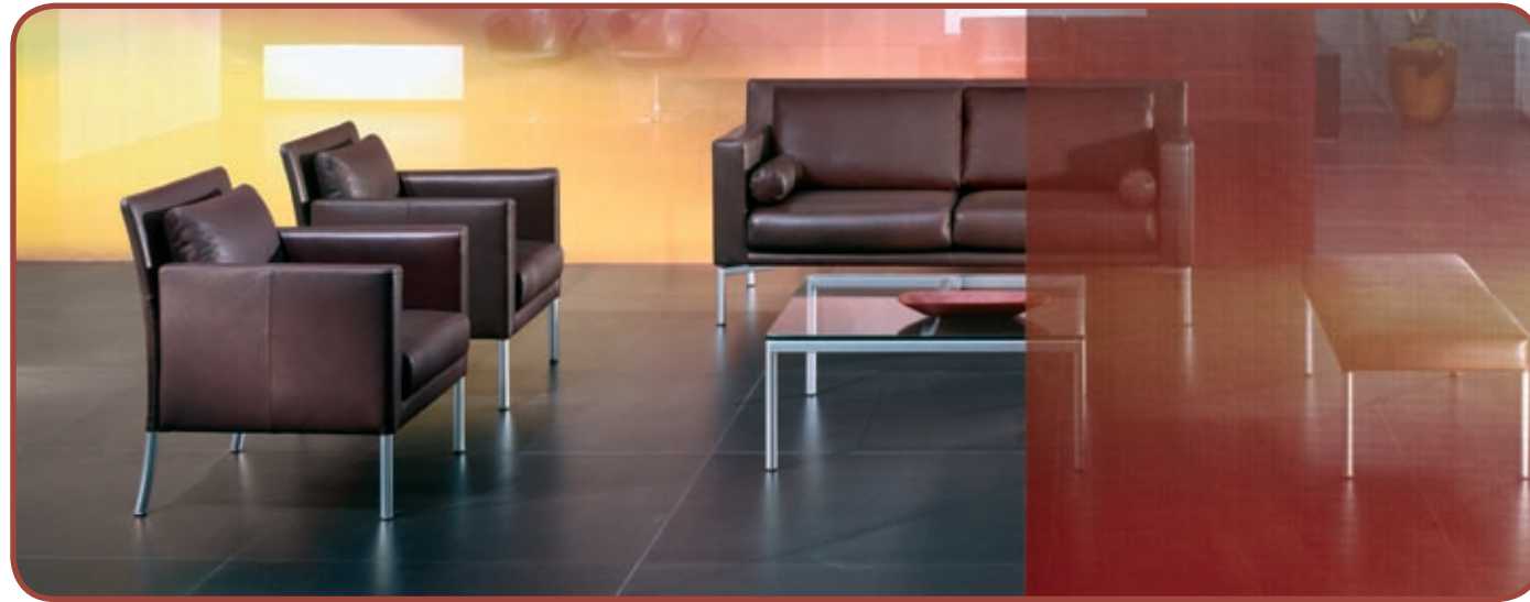
Jason 390. Design by EOO. Low-key style, reliable in everyday use, Jason stands for well designed seating comfort. The furniture set is complemented by matching chairs and tables.