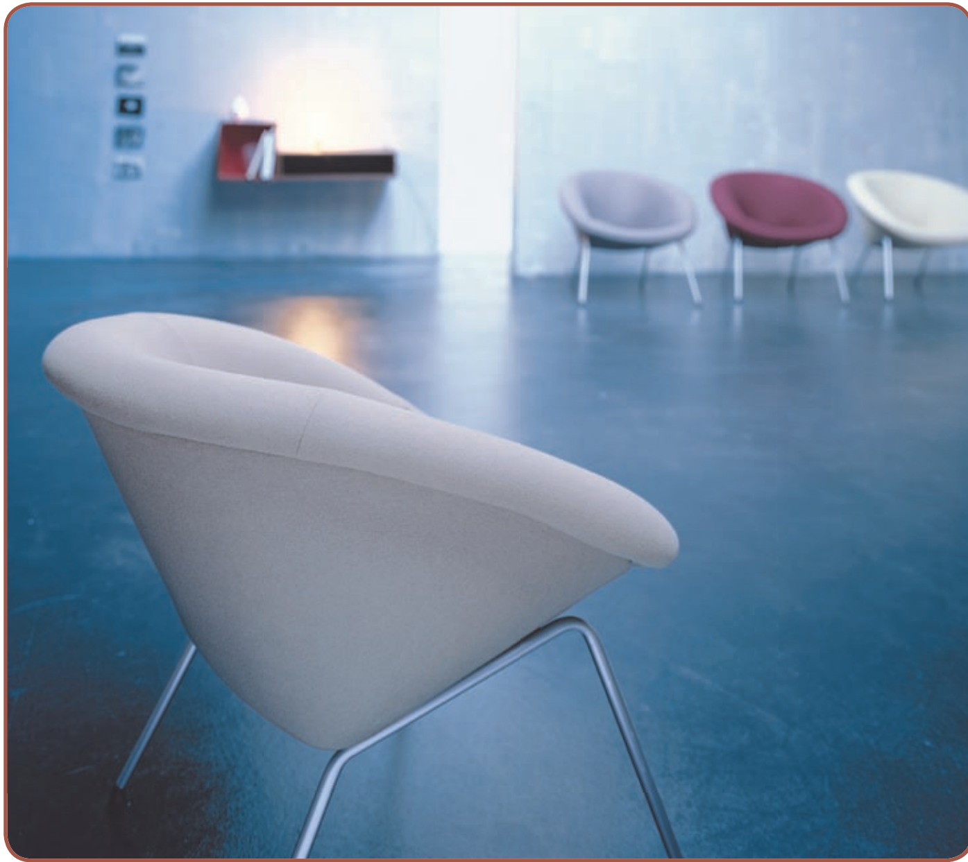
Classic Edition 369. Design by Walter Knoll Team. After being a smash hit with new shapes in the nineteen fifties, the 369 makes its mark again with a charming appearance, organic shape and perfect craftsmanship.