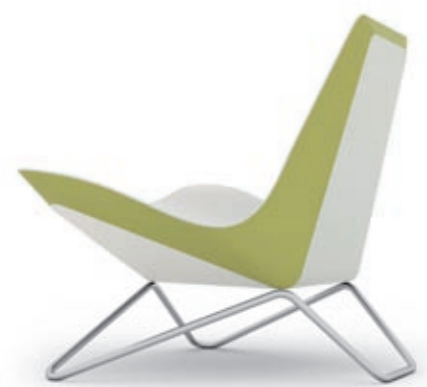
MYchair. Design by UN Studio/ Ben van Berkel. Impressive from all angles. The lounge chair is appealing and comfortable, and invites you to read, dream and relax.