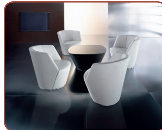
Ameo. Design by EOO. Round and round. The seating islands are easy to turn: towards each other for a conversation, away from the crowd for quiet contemplation.